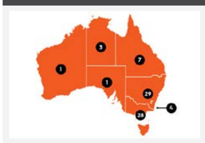
Figure 1: The health justice landscape by state or territory

Fourteen health justice services commenced in the 2017 calendar year and eight in 2018.