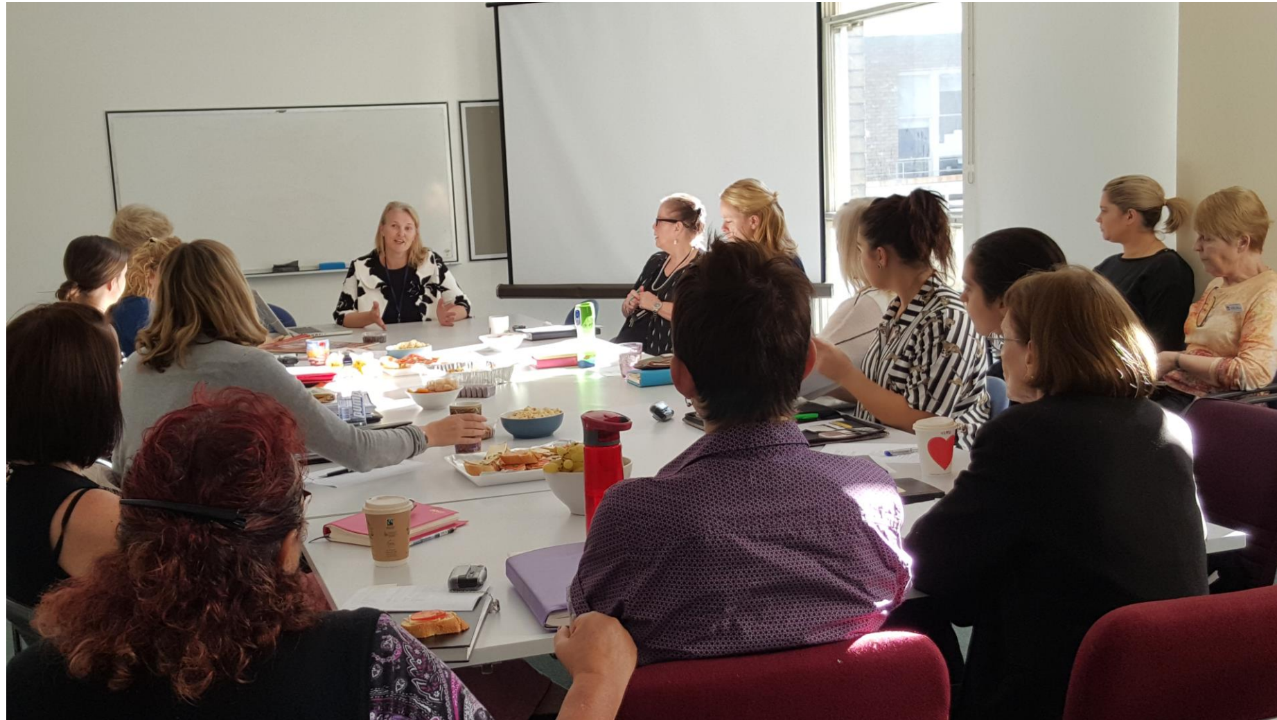
HJP in practice: Redfern Legal Centre lawyer works closely with the Social Work Department, Royal Prince Alfred Hospital (Sydney, NSW)