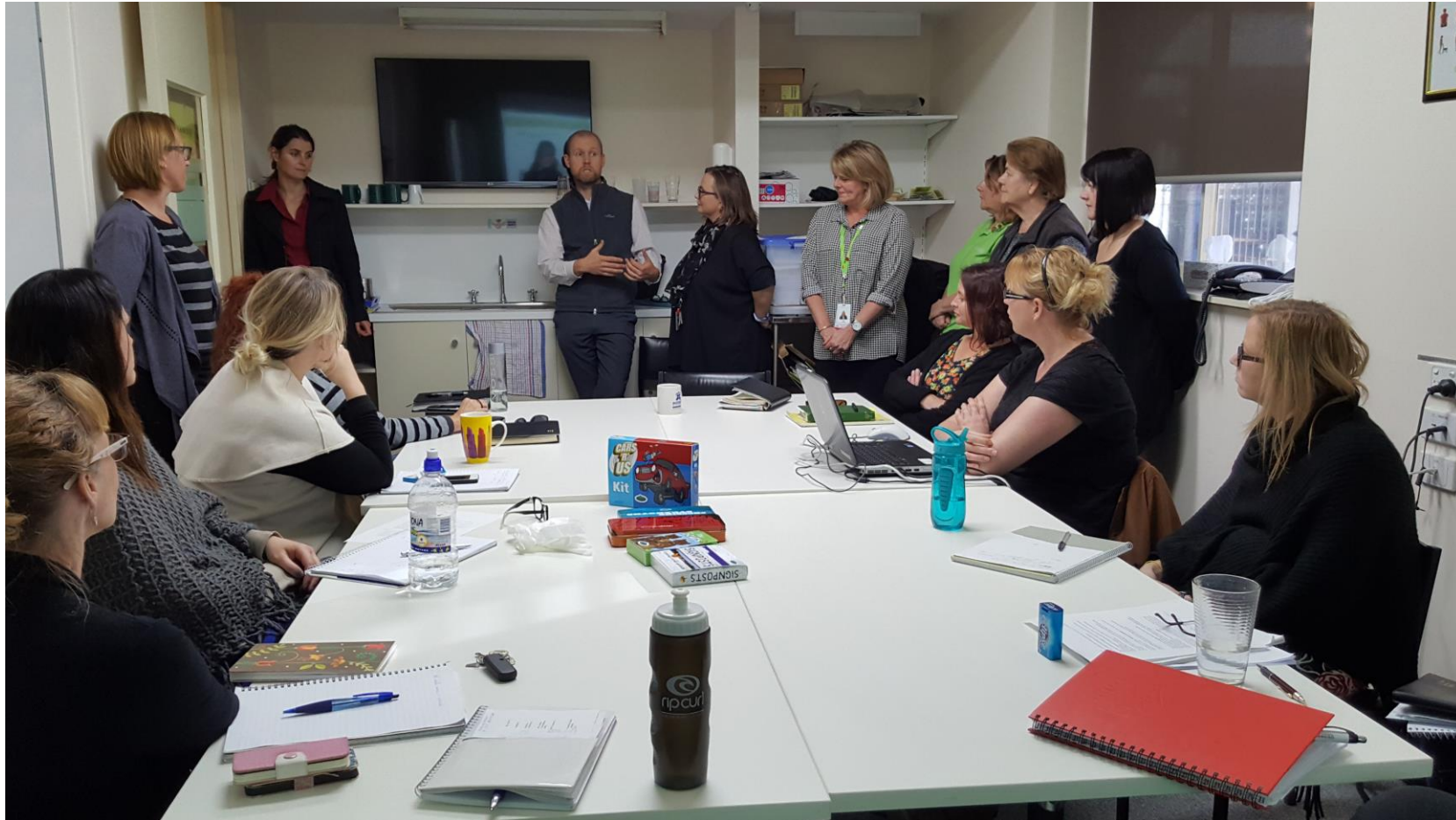
HJP in practice: Loddon–Campaspe CLC lawyers working with the Family Support team at Bendigo Community Health Service (Bendigo, Vic)